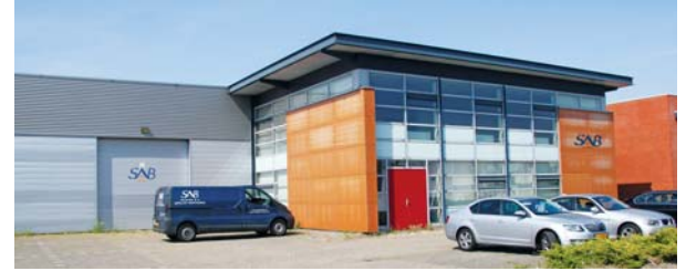
Sales Office / The Netherlands