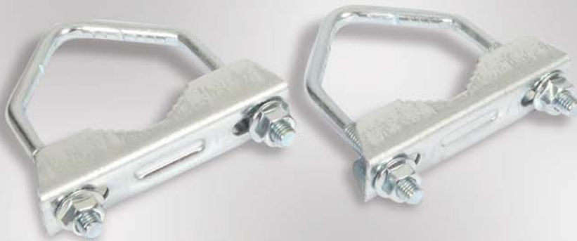
K103 "V" Clips