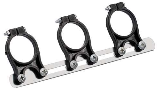
A025 Universal 3 LNB Holder

We can produce all mechanical pieces in electro galvanised, hot dipped or aluminum.