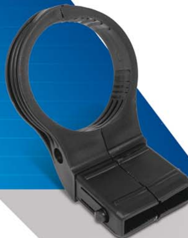
A027 Single LNB Holder