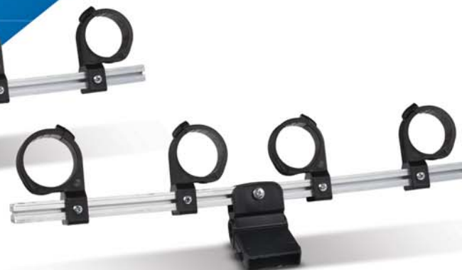
MFTS4 Multiblock 4 LNB Holder

We can produce all mechanical pieces in electro galvanised, hot dipped or aluminum.