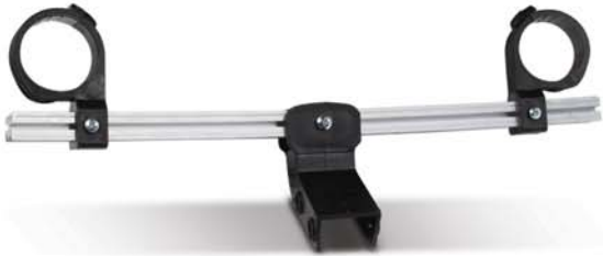
MFU2 Multi Feed Universal 2 LNB Holder