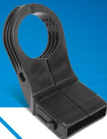
A026 Single LNB Holder