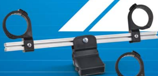
MFTS2 Multiblock 2 LNB Holder