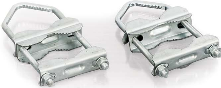
K102 "U" Clips