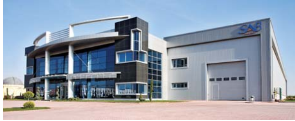
Factory / Turkey