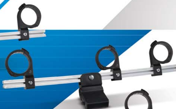
MFTS3 Multiblock 3 LNB Holder