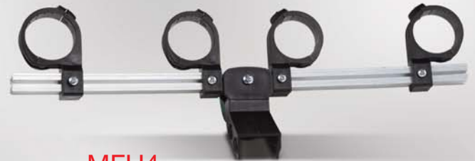
MFU4 Multi Feed Universal 4 LNB Holder