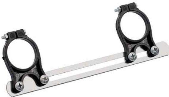
A024 Universal 2 LNB Holder