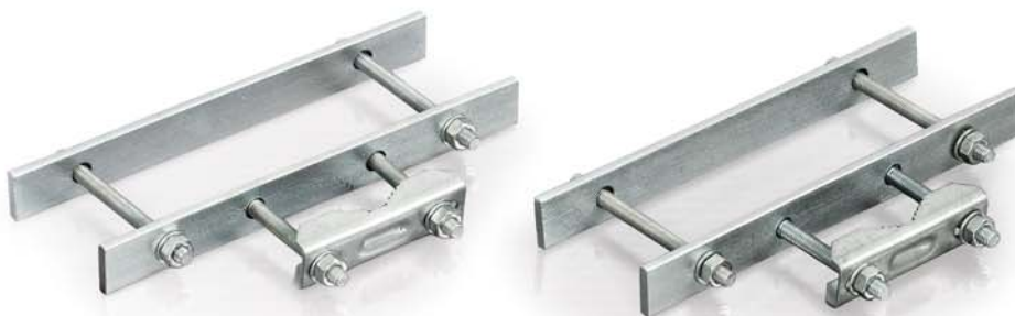
K104 Balcony Clips