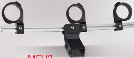
MFU3 Multi Feed Universal 3 LNB Holder