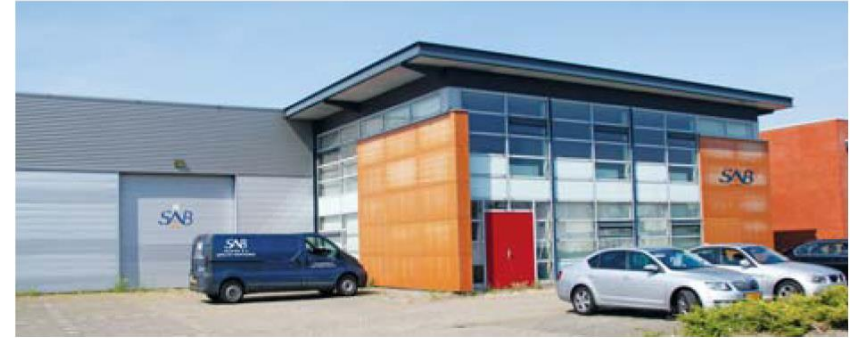
Sales Office / The Netherlands