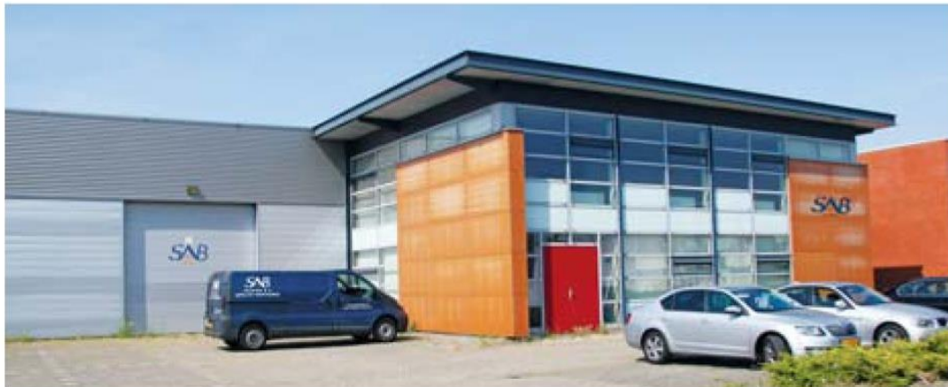
Sales Office / The Netherlands