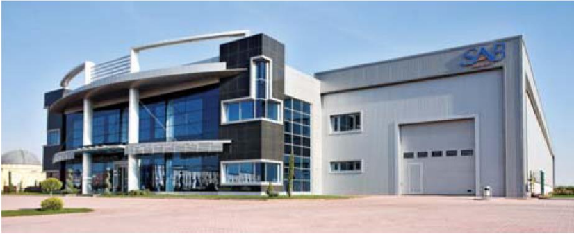
Factory / Turkey